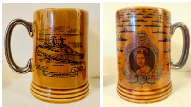
Ceramic Kent Jubilee Mug

He did eventually manage to get the ship cleaned and painted in time and the Fleet Review went magnificently.