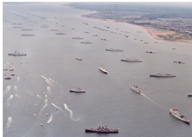
Spithead Review 1977 (Royal Yacht is passing HMS Fife, with HMS Kent next in the line of three DLGs)

same time. It is necessary to consider only those developments that are thought to be significant, extrapolate their effects and provide a reasoned opinion of what the future holds while racing against the clock to meet scheduled deadlines.